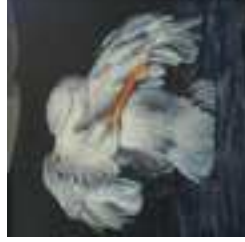
2nd Place: Scottie Whigham, "Silent Lucidity"