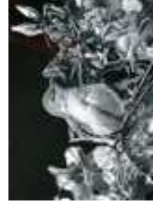
1st Place: Scottie Whigham, "King of Song"