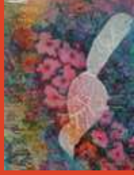
Creative Catalyst Productions DVD Gift Certificate Evelyne Breland, "The Mockingbird Sings"