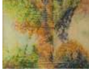
2nd Place: Gregory Carnes, "Country Lane"