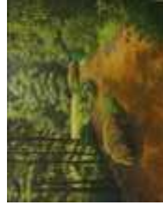
1st Place: Bety Dettre, "Gurgling Brook"